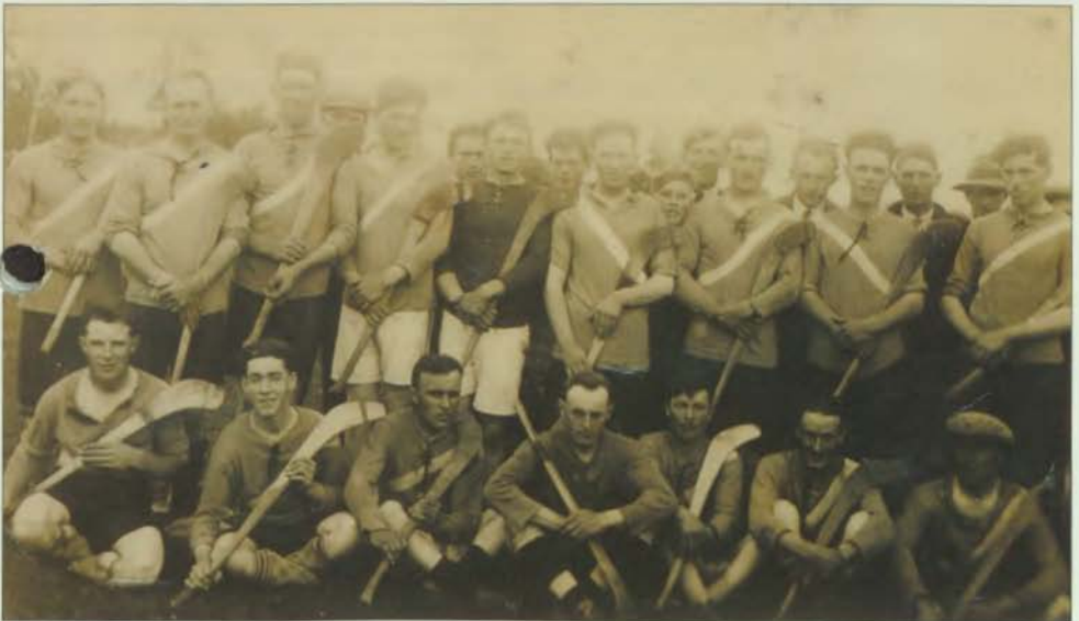
Kildangan Kilbarron team North intermediate champions 1930

Many clubs held the runners up spot. De Wets, Ballina, Templederry, Moneygall, Glenahilly, Youghalarra, Duharra, Borrisoleigh, Toomevara and Roscrea.