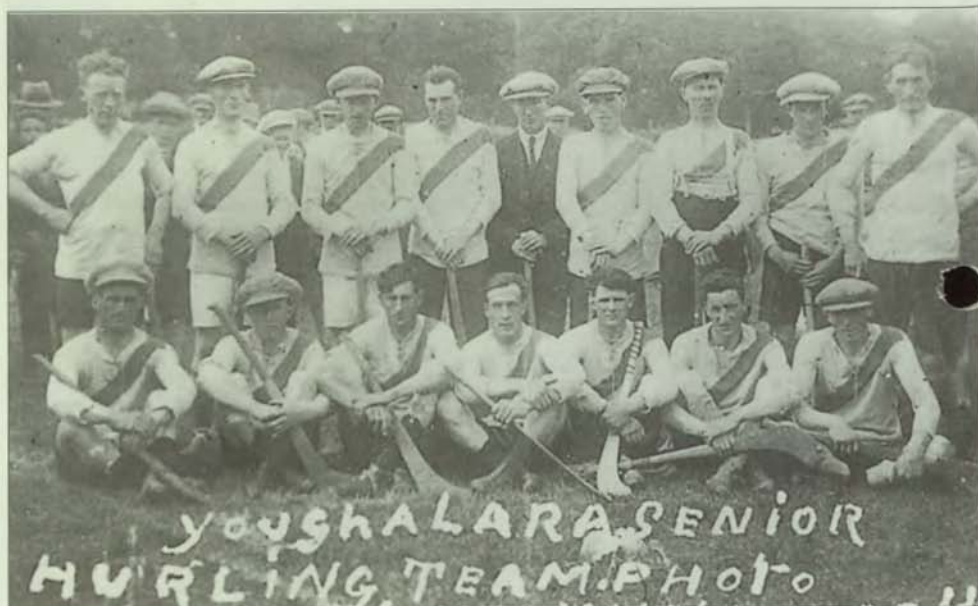
Youghalarra Senior Hurling team