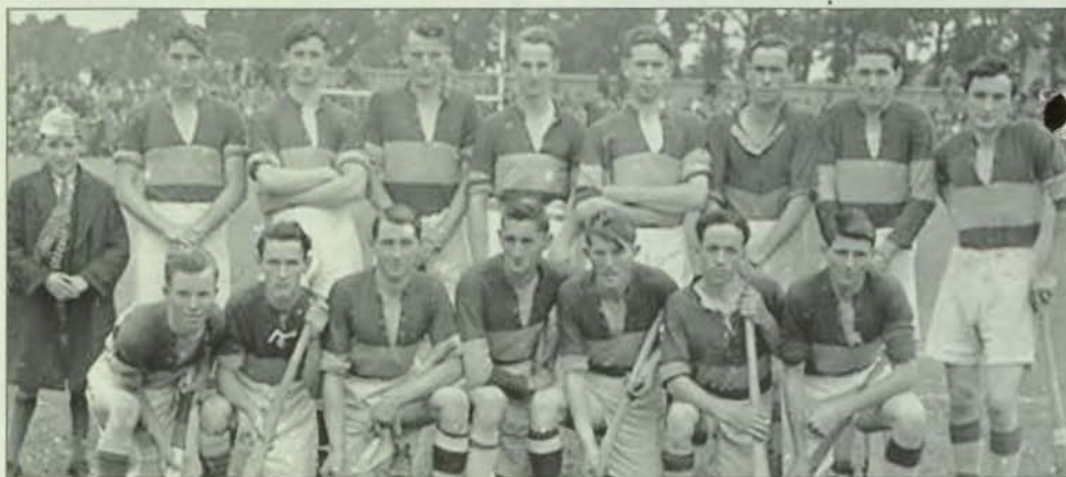
Tipperary minor hurling team 1949.