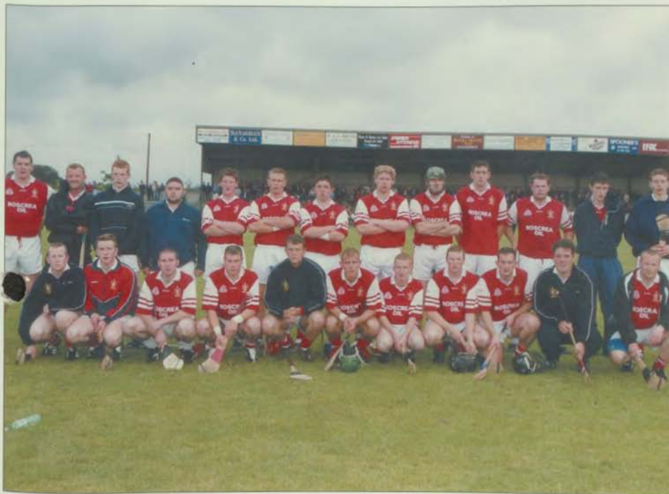
Roscrea, North Tipperary senior hurling champions 2004.