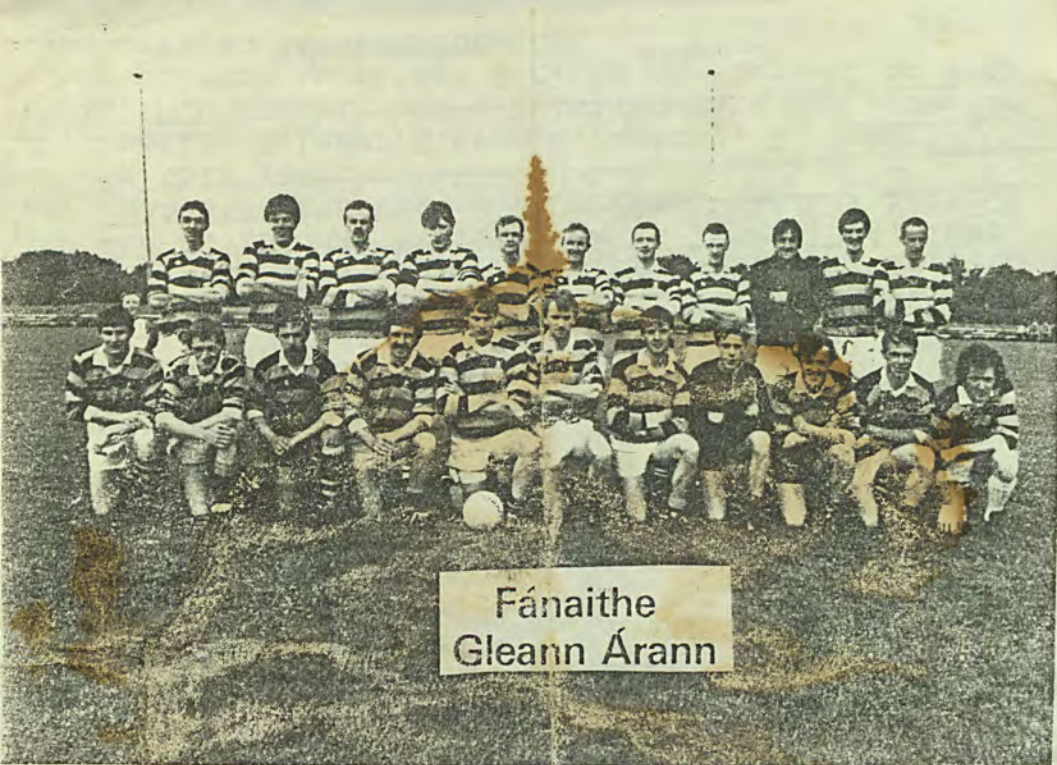
Fánaithe Gleann Árann