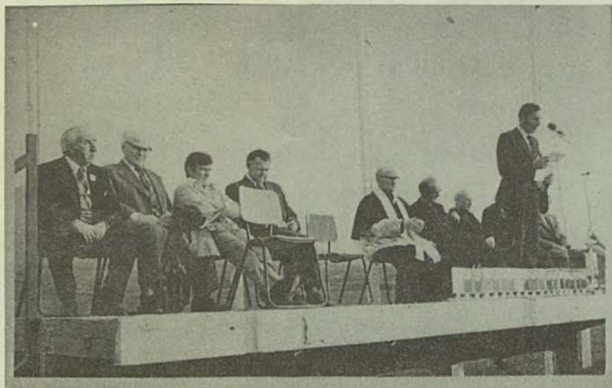
Photo taken at the opening of the O'Gorman Park, Lisvernane on Sunday evening, June 10, 1979.