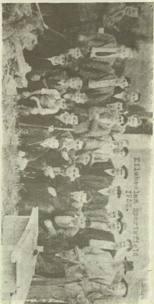
Kilsheelan Sportsfield 1952.

Some of the men who laboured voluntarily to prepare and layout the field.