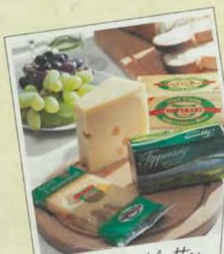
Cheese and butter