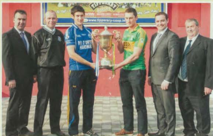
Launch of The West Senior Hurling Final