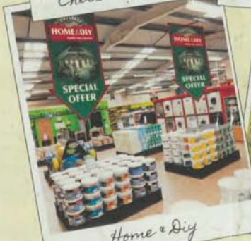
Home & DIY