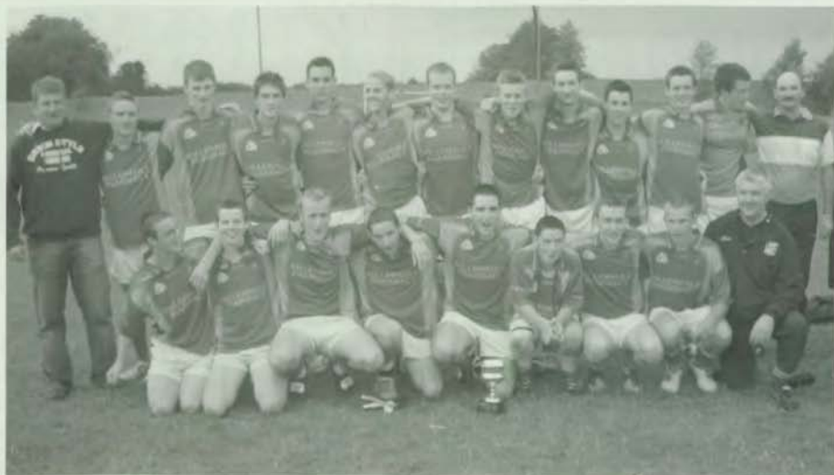
KILLENAULE MINOR A FOOTBALL TEAM 2006