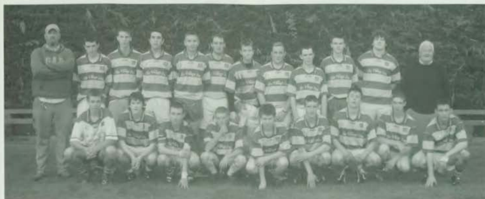
KNOCKMEALDOWN GAELS MINOR FOOTBALL TEAM 2009