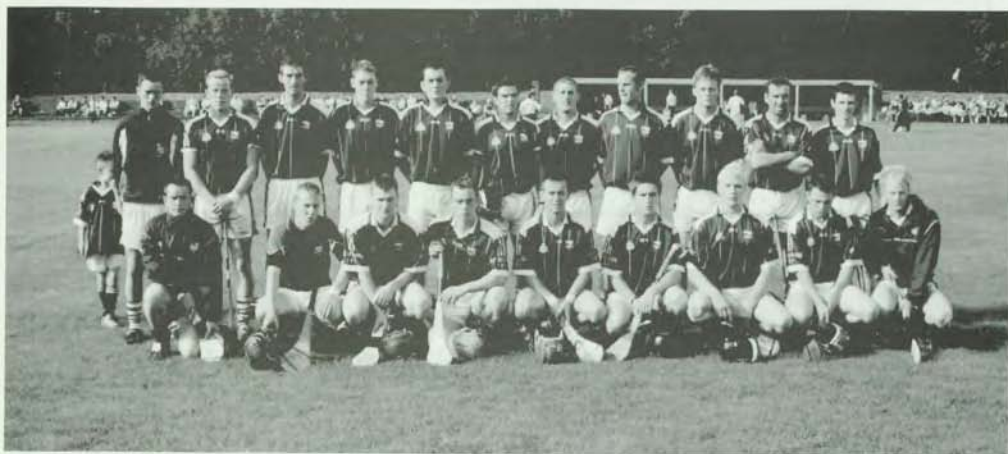
Ballingarry team that defeated Mullinahone in the South Semi Final