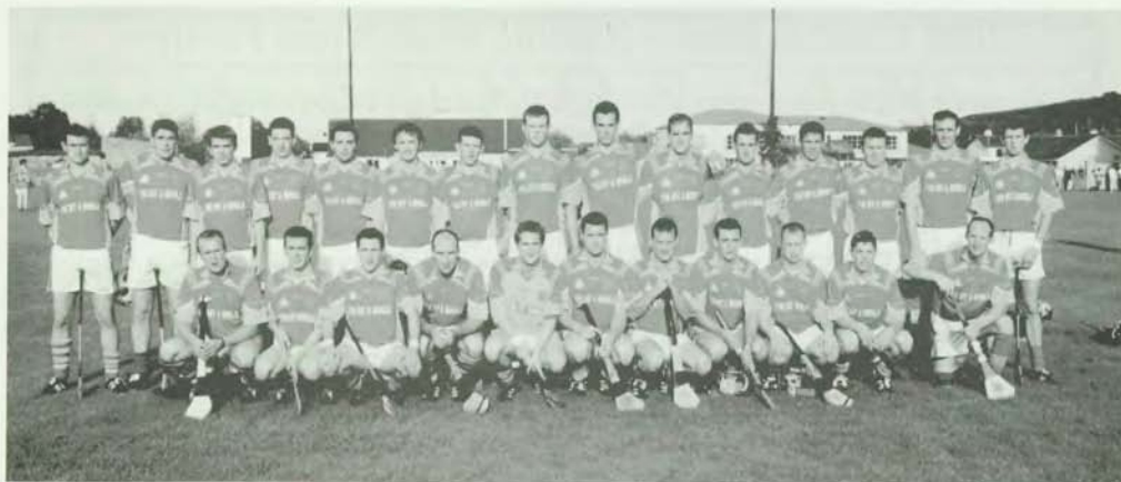
Killenale winners of the South Semi Final over Ballybacon Grange