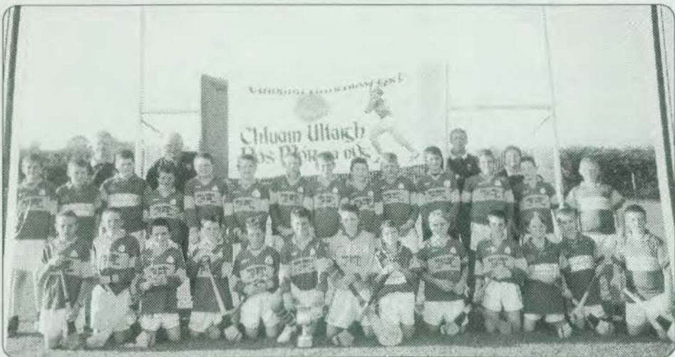
Clonoulty/Rossmore U12A - Winners of the County Final 2005