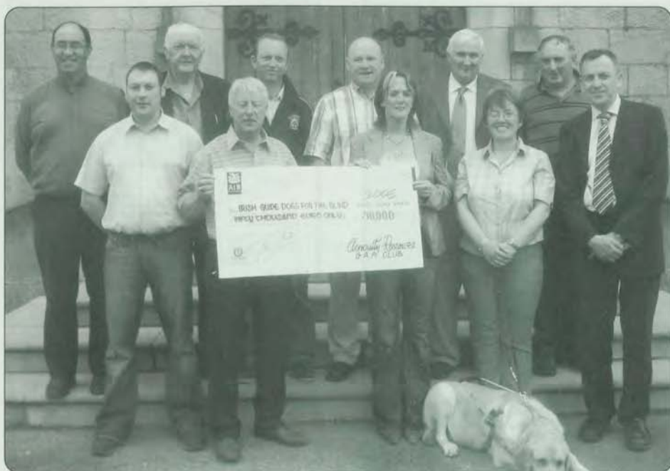
Clonoulty/Rossmore club members presenting a cheque for €50,000 to the Irish Guide Dogs for the Blind following a recent fund-raising venture.