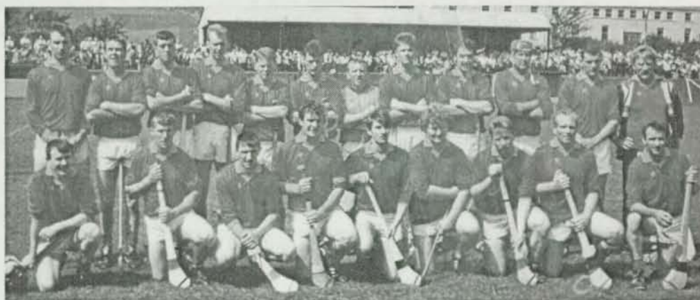
The Killenaule team that won the last South Senior Hurling title - defeating Carrick Swan in Clonmel in 1991.