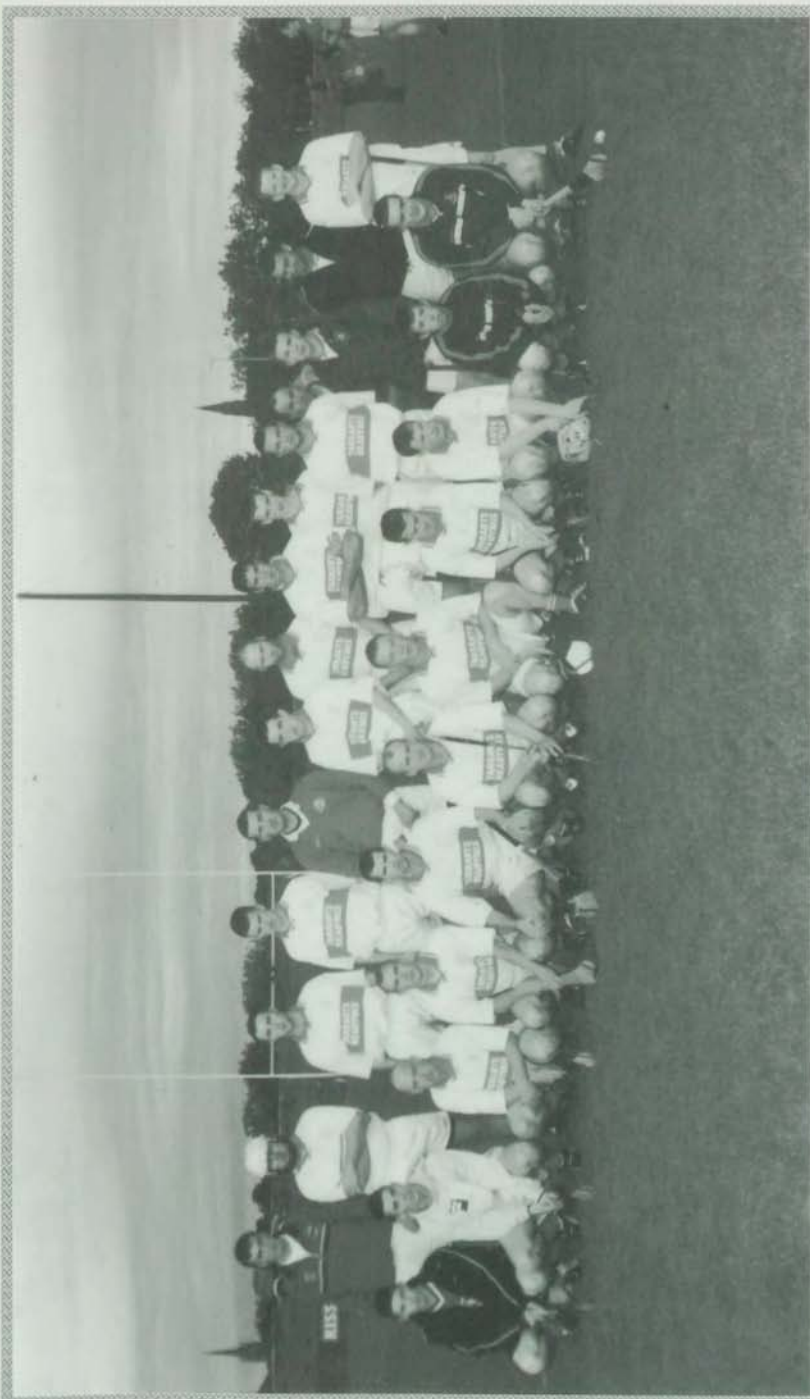
Galtee Rvs. Senior Hurling panel versus Cashel in first round