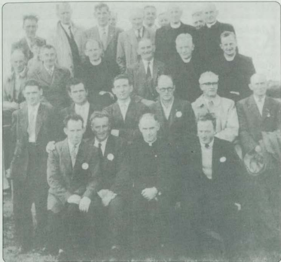
Group taken at the re-opening of Golden/Kilfeacle GAA ground following renovation work in 1960.