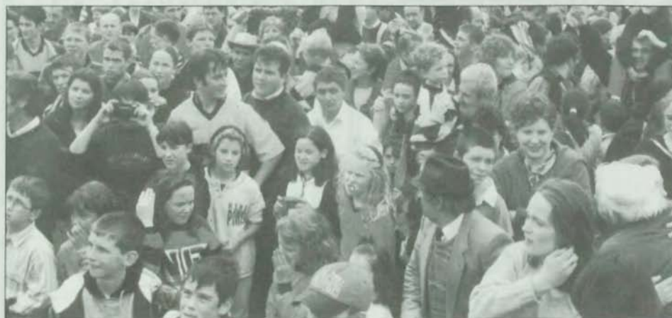
Faces in the crowd - 1997