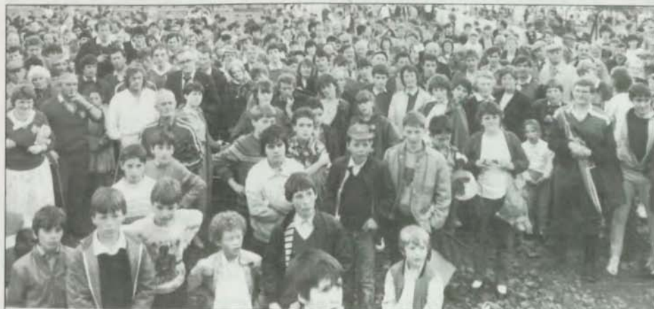
Faces in the crowd - 1986