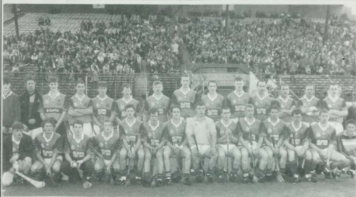
MULLINAHONE - SOUTH CHAMPIONS AND CO. FINALISTS 1997