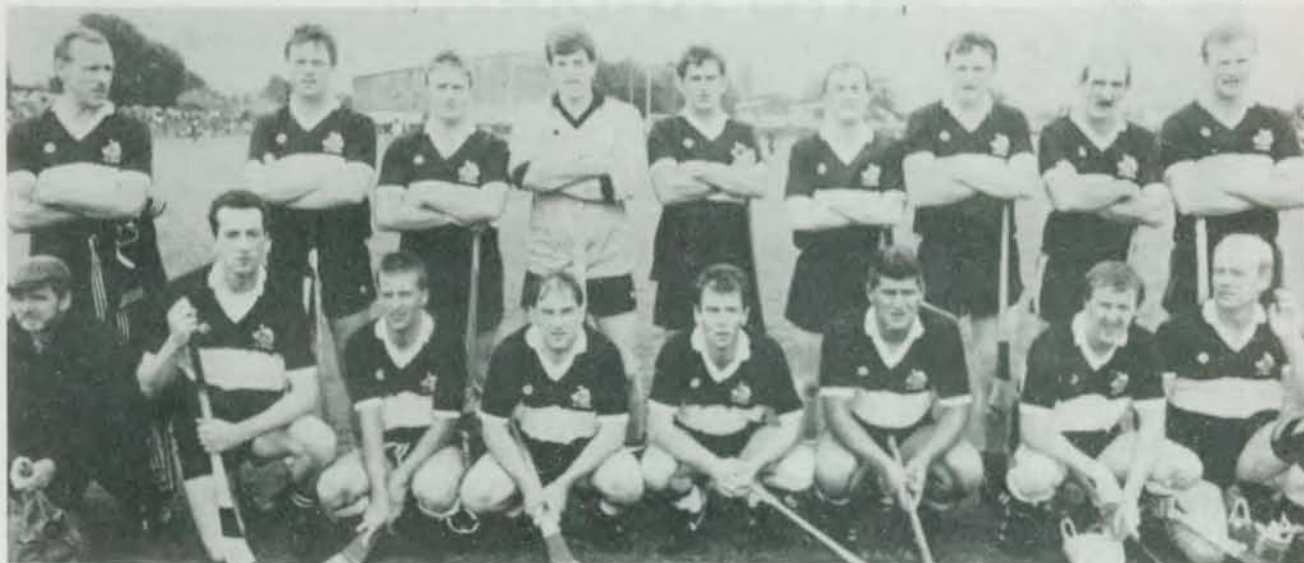
CARRICK SWAN - South Senior Hurling Champions