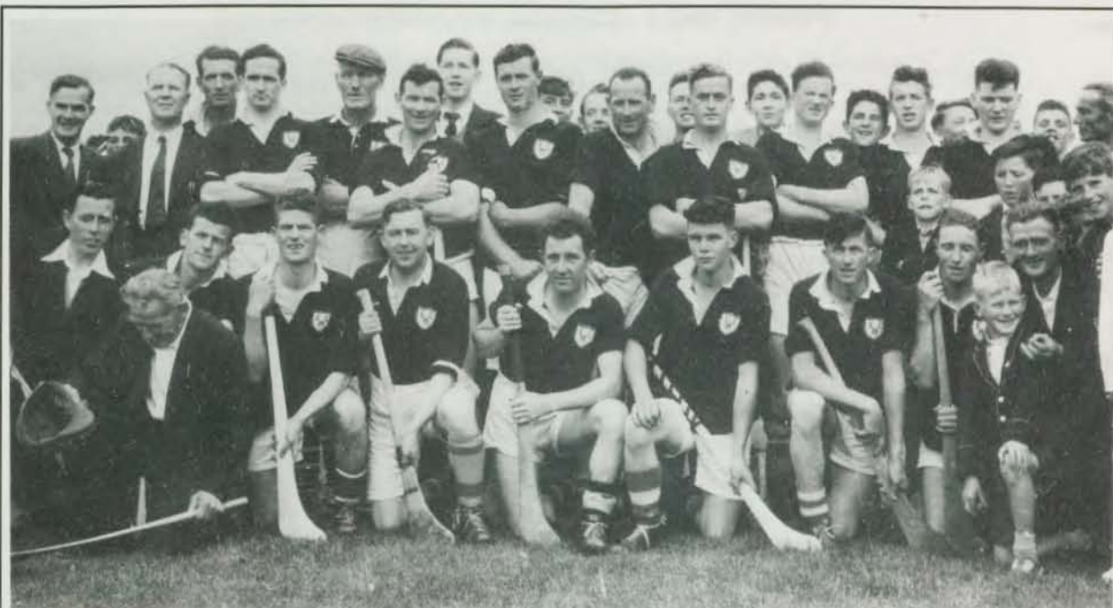
SWANS - SOUTH S.H. CHAMPIONS 1958 / '59