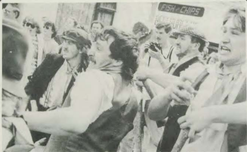
Cappawhite Faction Fighters hold the spectators spellbound