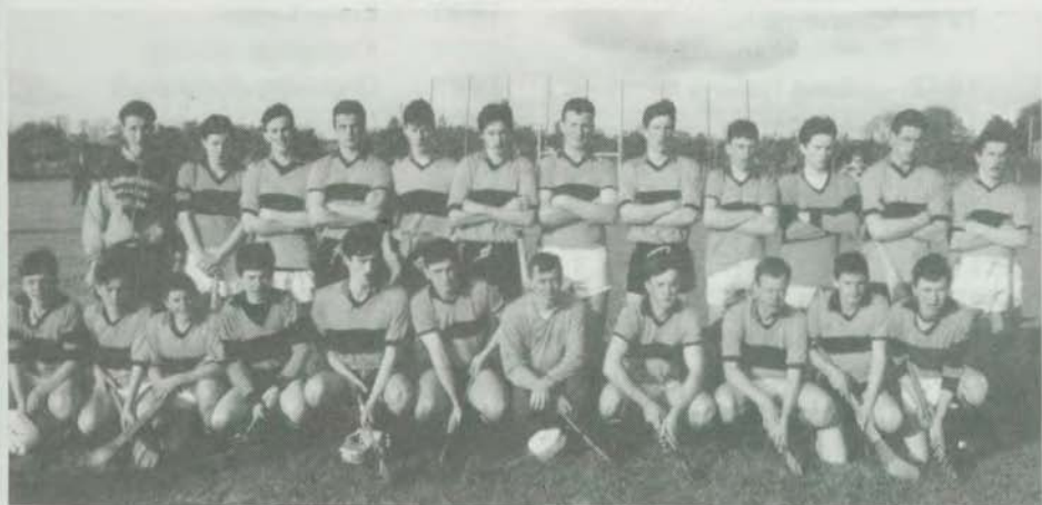
KICKHAMS MINOR TEAM