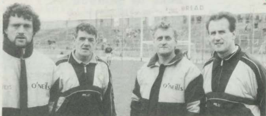
Cashel King Cormacs' Mentors