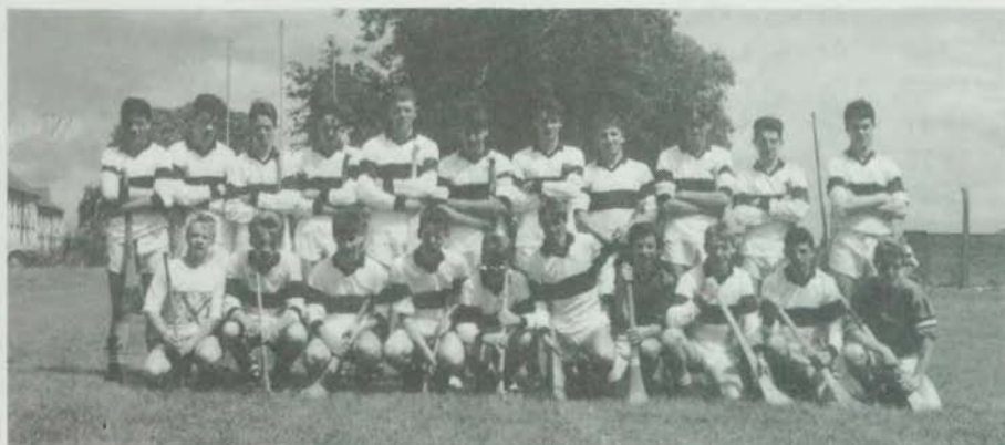
GALTEE ROVERS MINOR TEAM