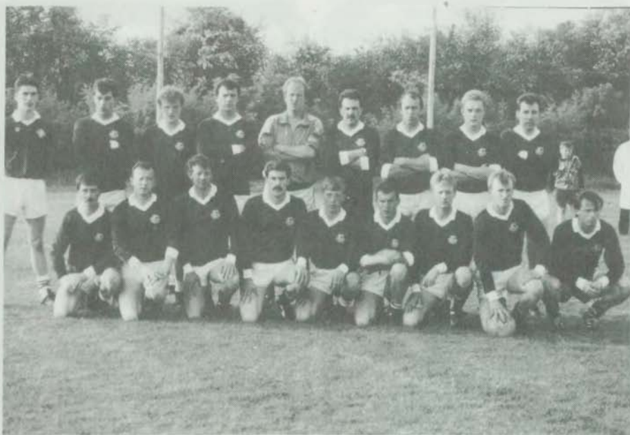
GALTEE ROVERS -- 1991 WEST SENIOR FOOTBALL CHAMPIONS