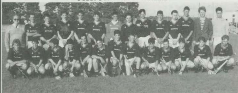
CASHEL MINOR TEAM