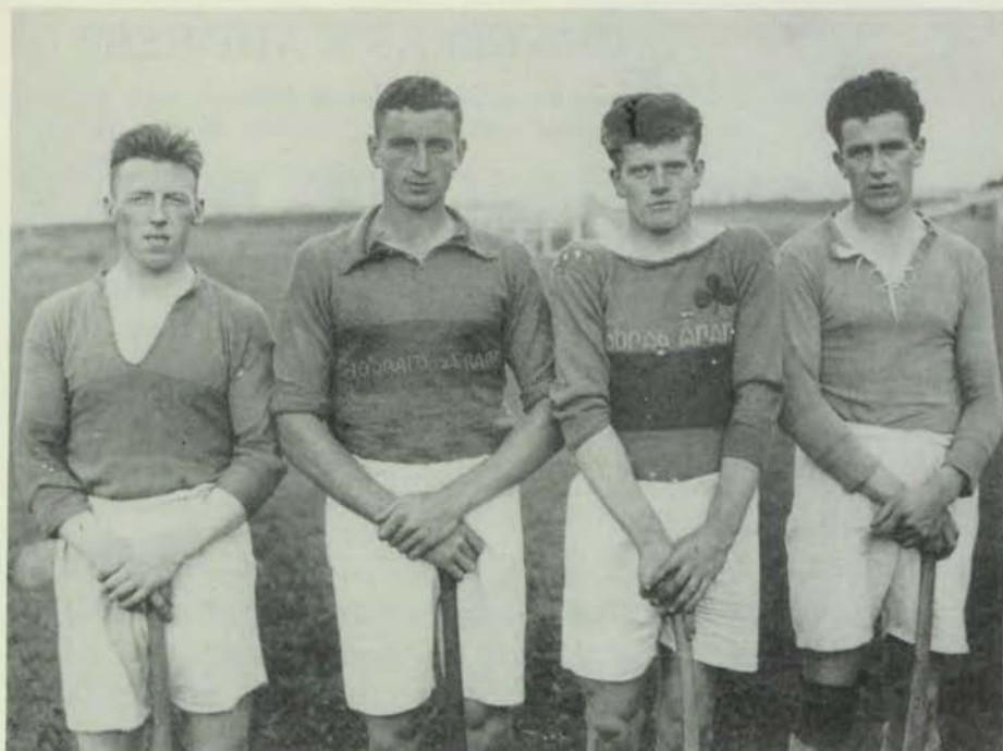
1937 - THE GOLDEN CONNECTION