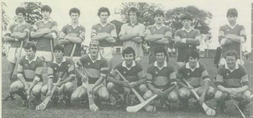
Clonoulty/Rossmore S.H. Team 1983 - Clonoulty, runners-up to Cashel in the Crosco Cup S.H.C. Final in Bansha.