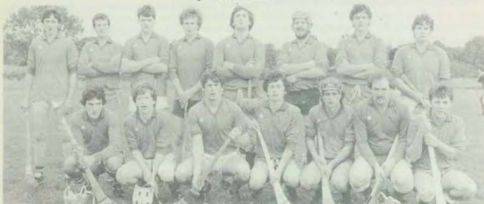
Cashel U/21 Team West Hurling Champions 1983.