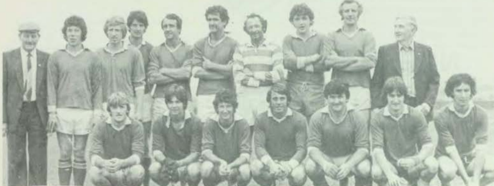
Golden/Kilfeacle S.F.C. Losers Group v. Cappawhite in Sean Treacy Park.