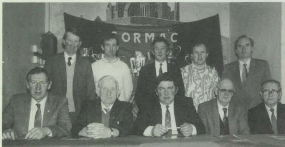
Bord Officers at AGM in Cashel, 1989.