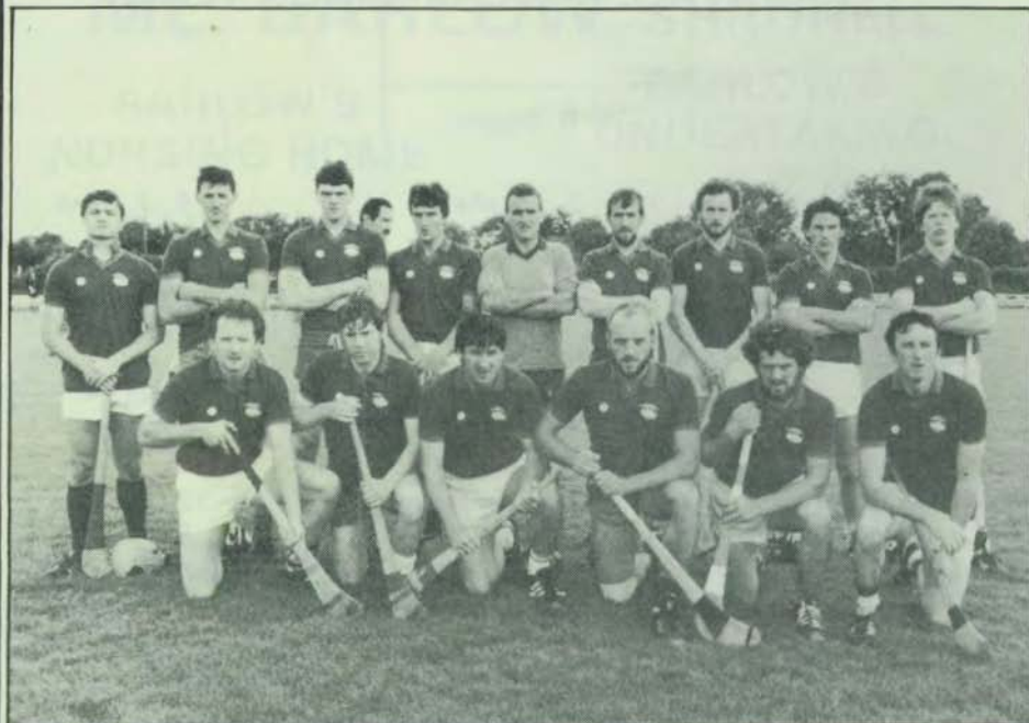
CASHEL KING CORMACS