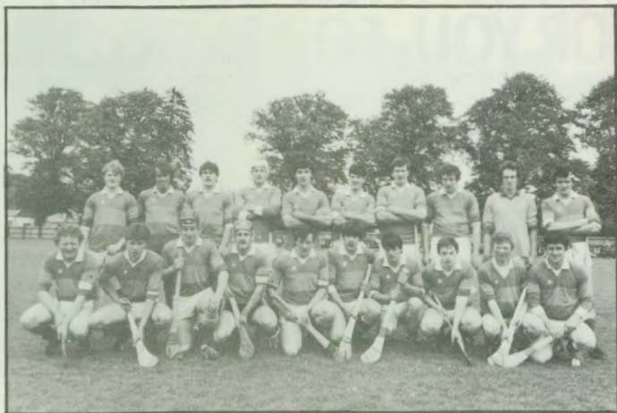
CLONOULTY S.H. 1984