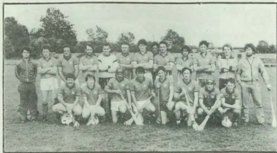
CASHEL S.H. 1984