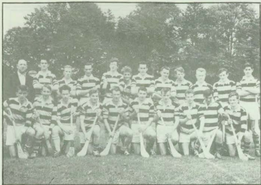
ARRAVAL ROVERS — 1966 WEST SENIOR HURLING CHAMPIONS