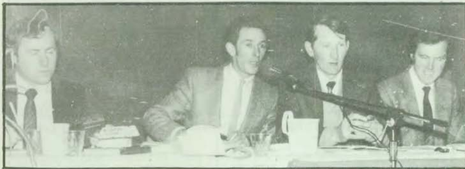
WEST BOARD OFFICERS — 1984