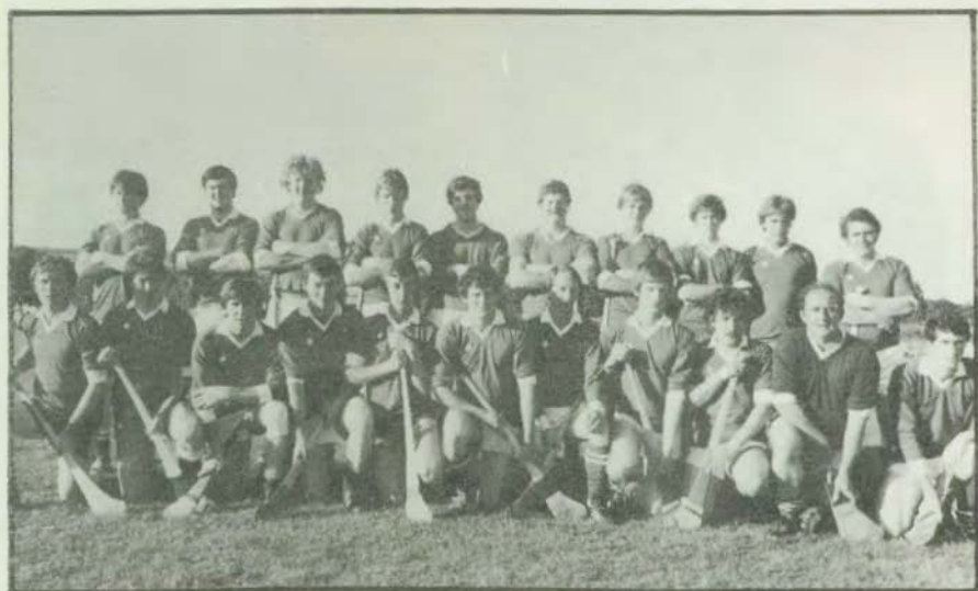
EIRE OG S.H. 1984