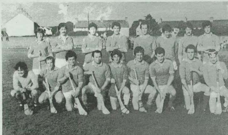
THE EIRE OG TEAM WHICH DEFEATED BALLINGARRY IN THE SEMI-FINAL