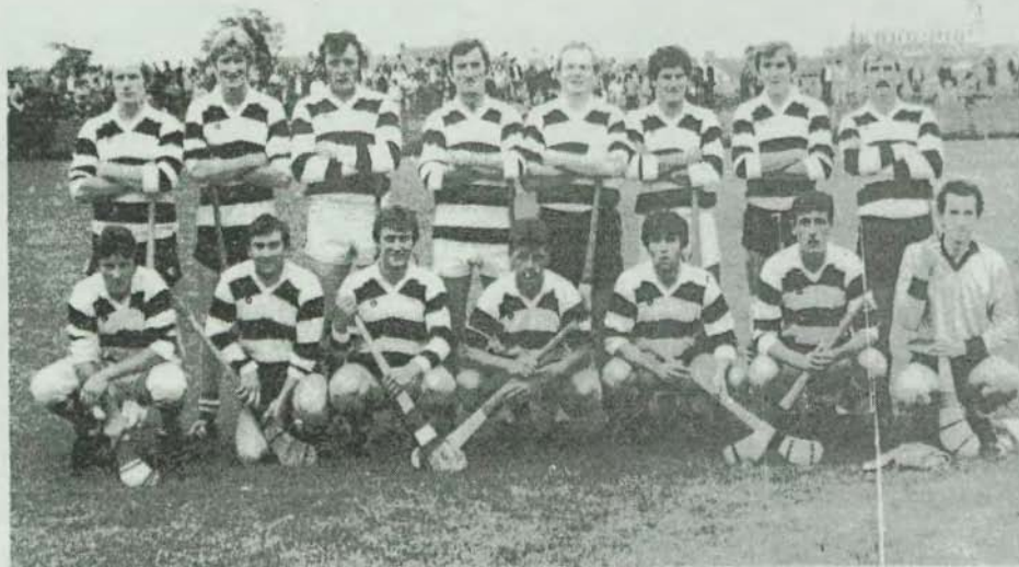
THE SWAN TEAM WHICH DEFEATED DAVINS IN THE SEMI-FINAL

101 Main St., Carrick-on-Suir Tel.: 40272