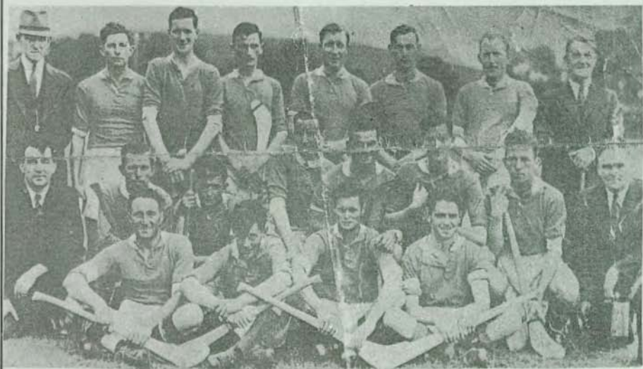
The St. Mary's J.H. Team of 1941