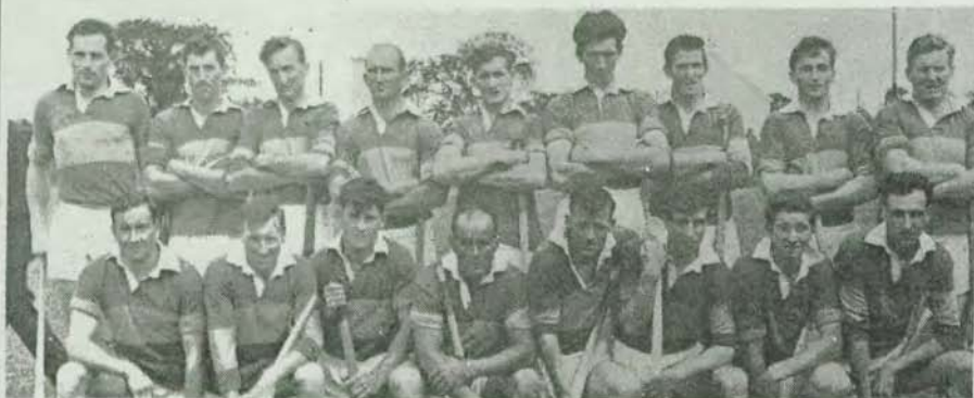
Kilsheelan/Fethard S.H. Finalists, Possibly 1965 or 66. South Final in Kilsheelan V Davins team called Slievenamon, Davins Won.

There is every hope that 1982 will prove a milestone in the history of the combination who in the opinion of many will prove more than a match for St. Mary's in today's final and will whatever the outcome emerge worthy ambassadors for the South Division in the County Quarter-finals on August 8th.