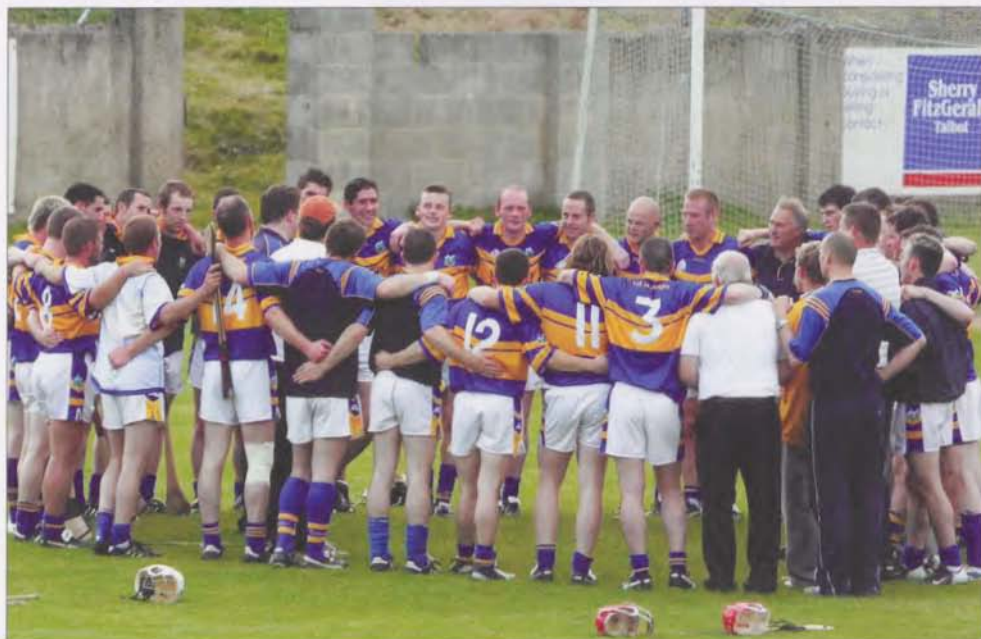
Kildangan team talk following their victory of Roscrea in the North Tipp senior hurling semi-final.

There were major prizes for the winners, runners up and third placed teams with 17 silver watches, 17 suits of Irish tweed and 17 Irish made jerseys going in that order.