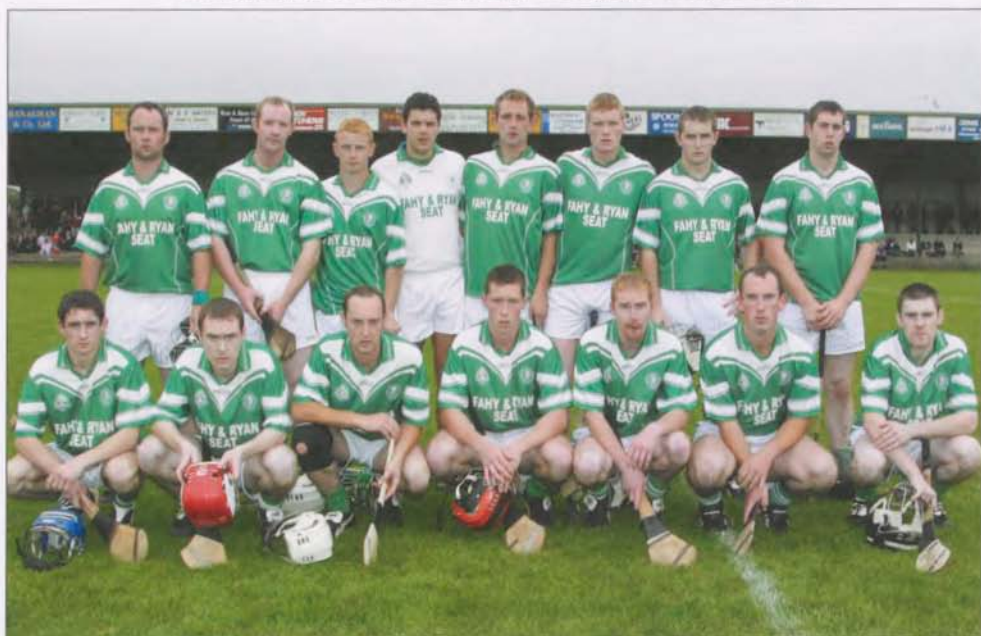
Templederry 2008, Intermediate Hurling League Champions.