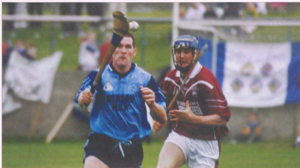
Action from the 2001 North senior final between Nenagh Eire Og and Borris-Ileigh