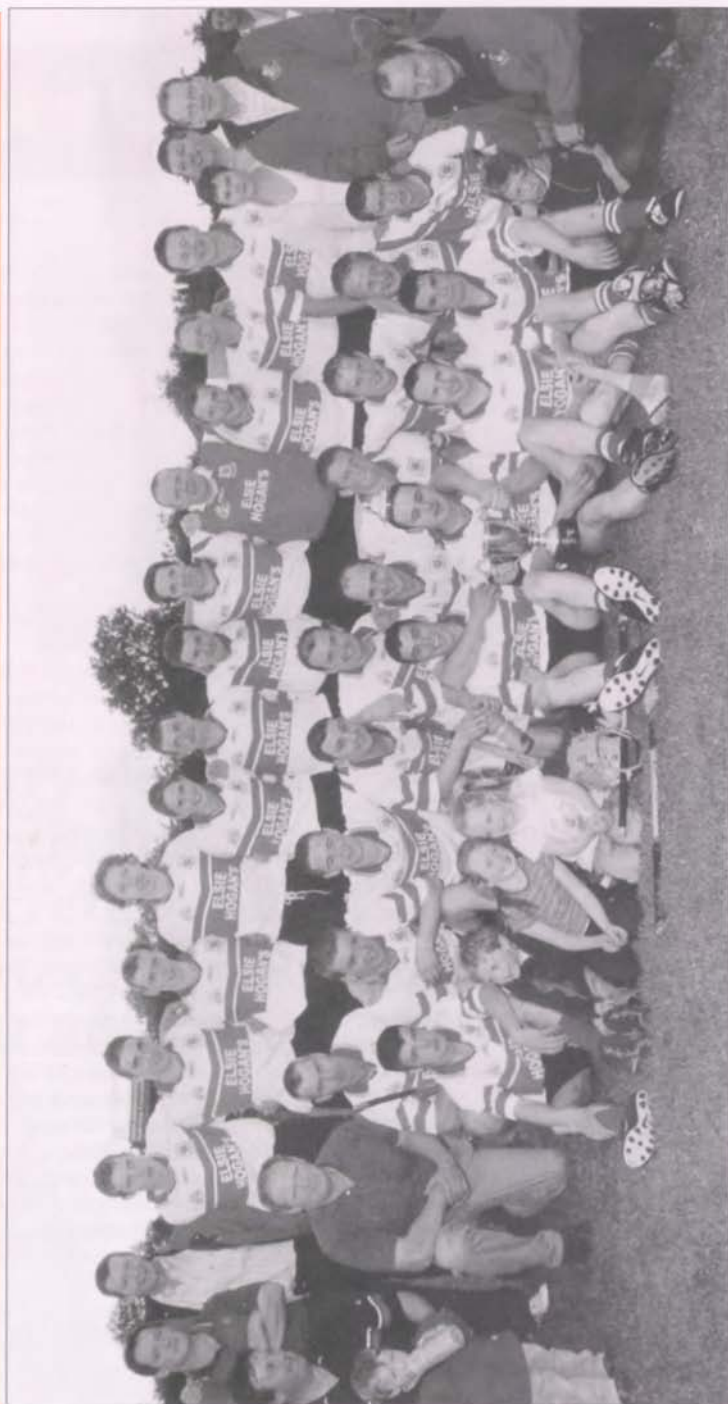
Shannon Rovers, League Champions, 2004