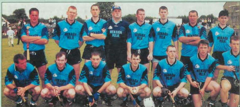
NENAGH ÉIRE ÓG TEAM