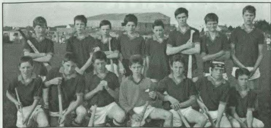
Toomevara North U/12 Champions 1989