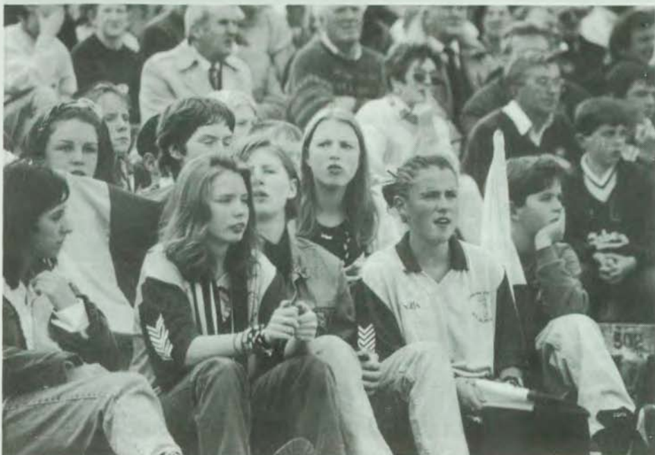
Some young Nenagh Éire Óg supporters at the County final in 1995.