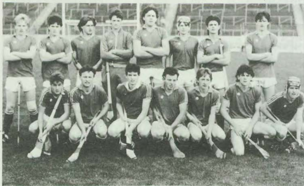
The 1986 Toomevara Minor County Champions.