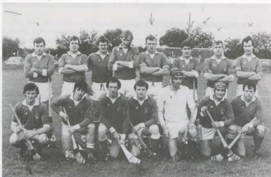
SARSFIELDS MID FINALISTS 1985