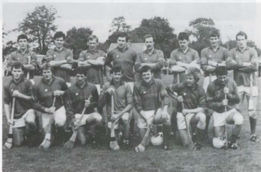
LOUGHMORE-CASTLEINEY MID CHAMPIONS 1986