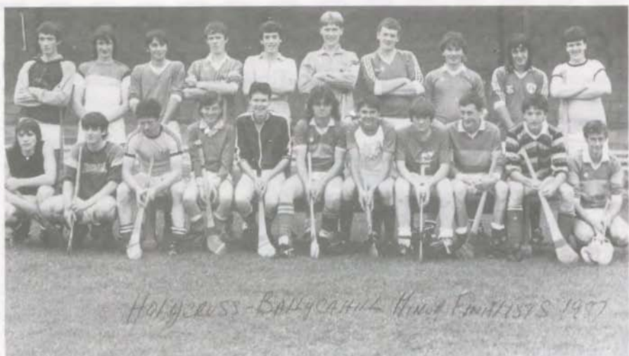
HOLYCROSS-BALLYCAHILL MINOR FINALISTS 1987