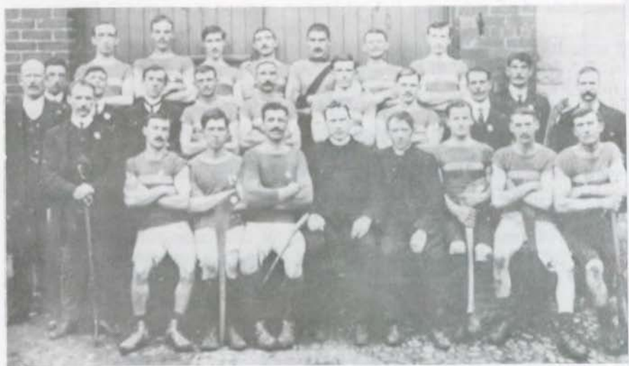
Another photo of the Tipp. All-Ireland hurling champions 1908 (Thurles Sarsfields selection), and Munster champions 1909.