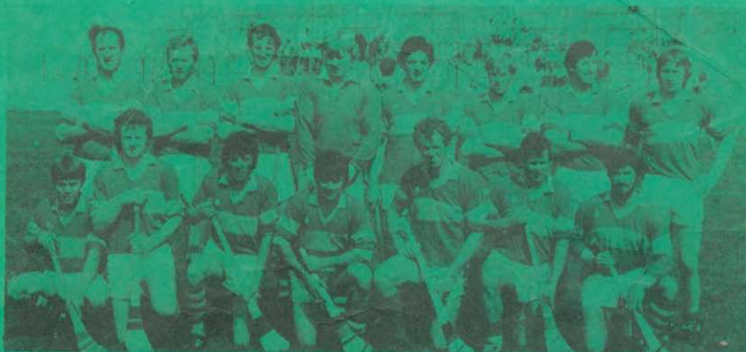
THE MOYCARKEY-BORRIS TEAM WHICH DREW WITH DROM-INCH