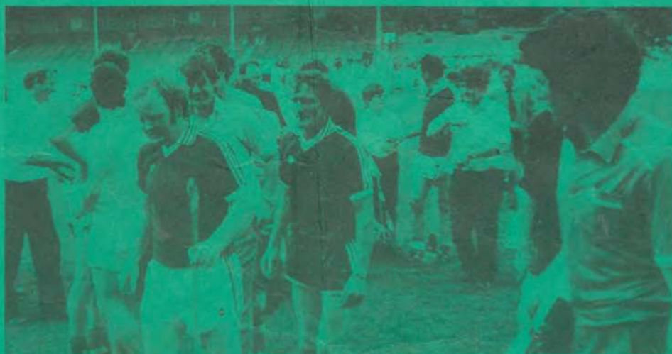
Familiar Drom faces after the drawn game.