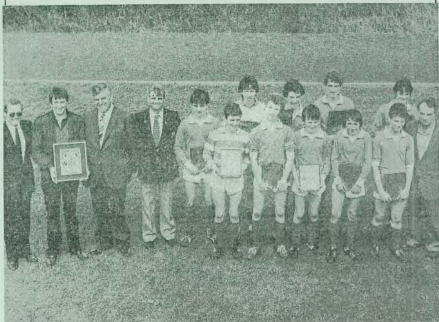
FETHARD U15 SEVEN-A-SIDE TEAM