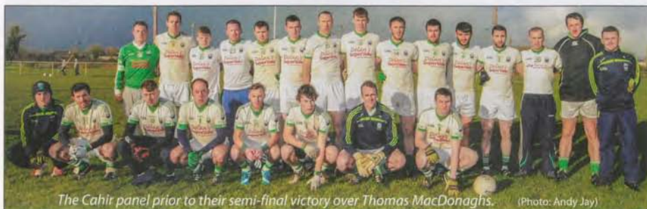
The Cahir panel prior to their semi-final victory over Thomas MacDonaghs.

T ODAY Cahir contest its third County Senior Football Final, having won one and lost one.