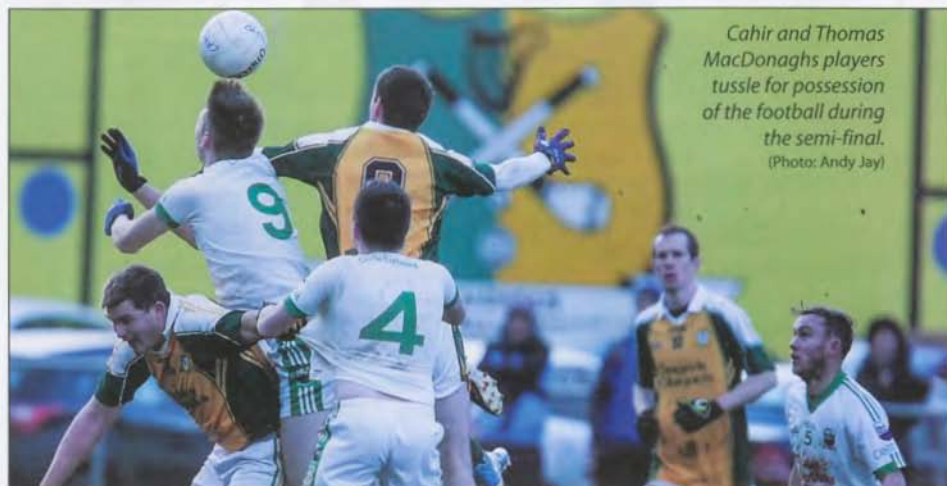
Cahir and Thomas MacDonaghs players tussle for possession of the football during the semi-final.