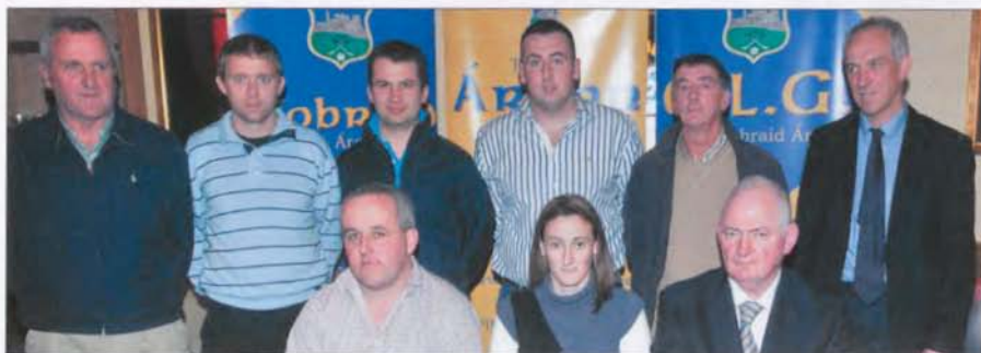
Moyle Rovers Club Officers, Players and Team Management