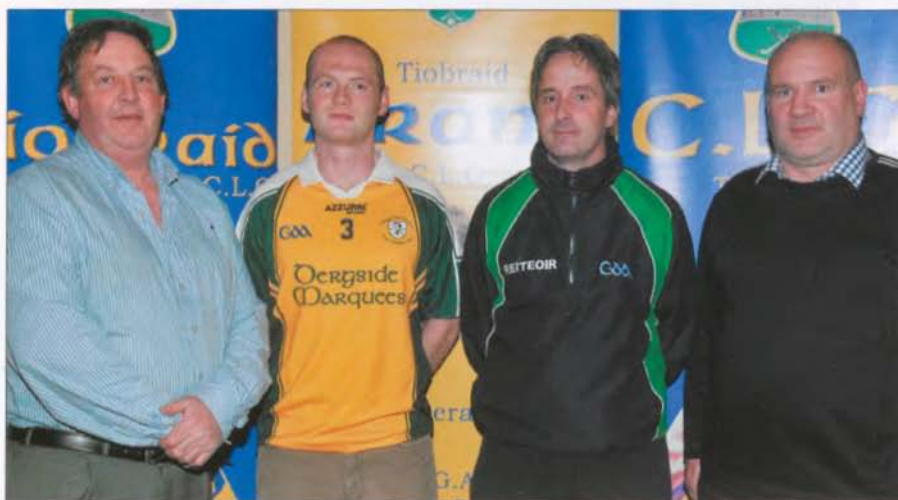
Thomas MacDonaghs Management Team

It can only be seen as another positive side in the growth of the game in the county at the moment to see a North Tipperary side play in the county senior football final for the first time since Kilruane McDonaghs success in 1975 and in time will hopefully lead to the improvement of the game at adult club level which would dilute the need for divisional teams in the future.