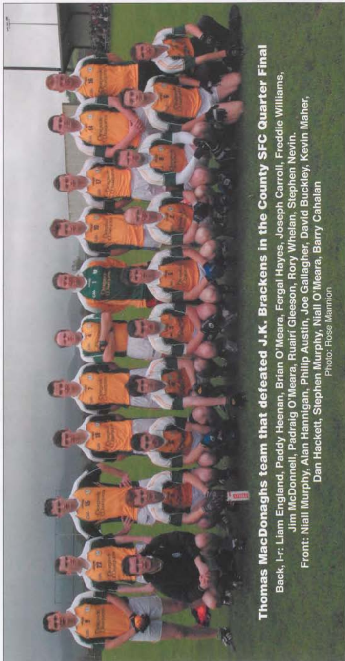
Thomas MacDonaghs team that defeated J.K. Brackens in the County SFC Quarter Final