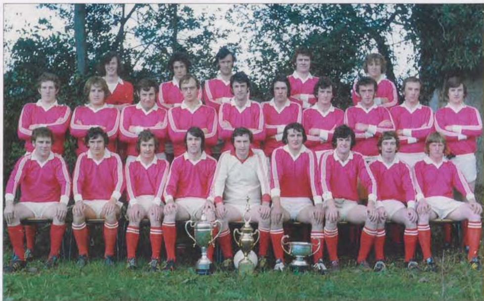
Galtee Rovers 1976

The final was an intriguing pairing – An all west affair as we were up against our near neighbour Arravale Rovers of Tipperary Town. A