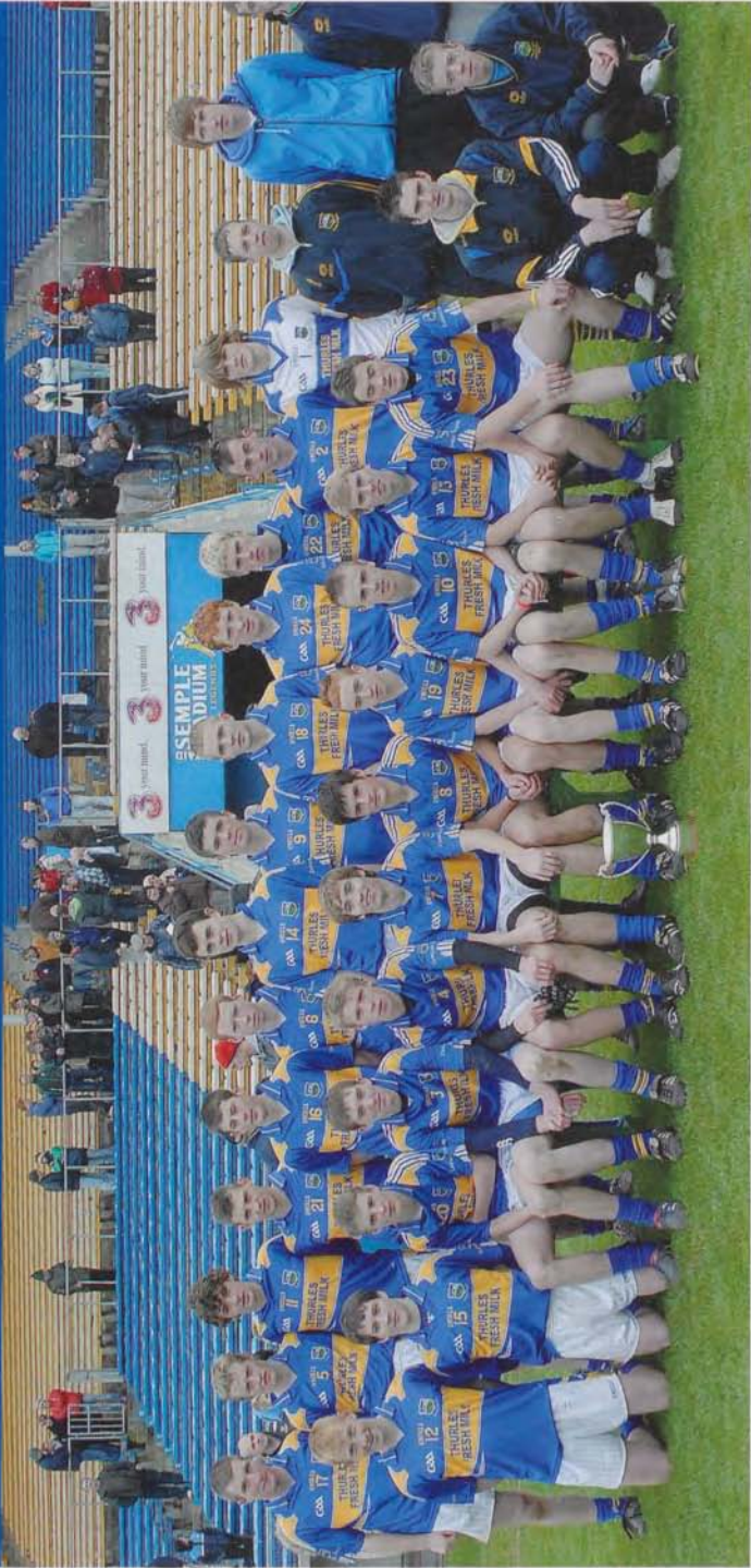
Tipperary Under-17 football team, winners of the inaugural Darrell Darcy Cup