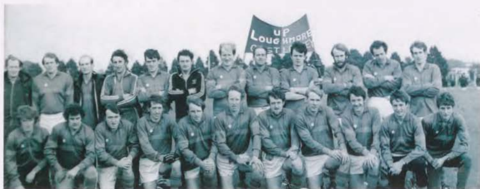
Senior Football Co. Champions 1983 Loughmore-Castleiney