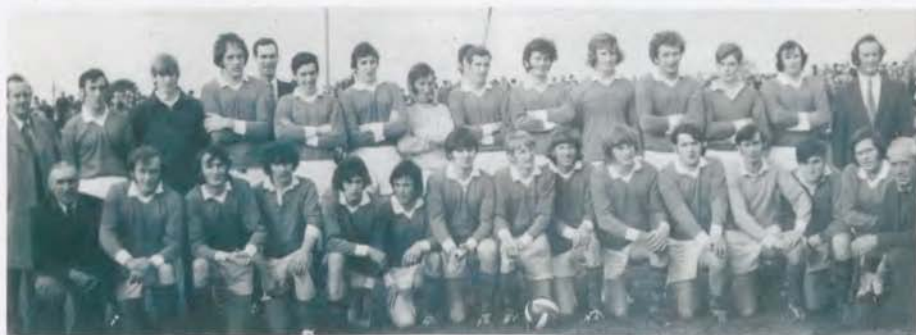
County Senior Football Champions 1973 - Loughmore-Castleiney

Loughmore-Castleiney failed to make it to the county semi-final in 1974 and won the Mid final by virtue of a walkover from Templemore. In 1975 Loughmore qualified for the county semi-finals and defeated Ardfinnan by 3-11 to 1-5 at Cashel on August 10. Their opponents in the final were Kilruane MacDonaghs, who had caused