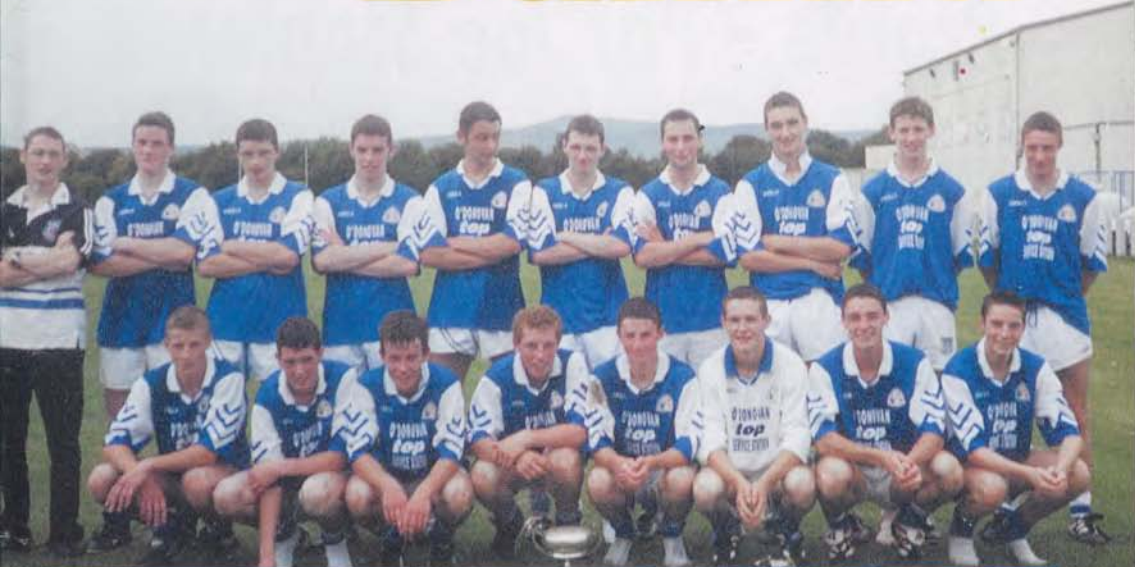
Ballina Minor Football Panel North Championship 2000