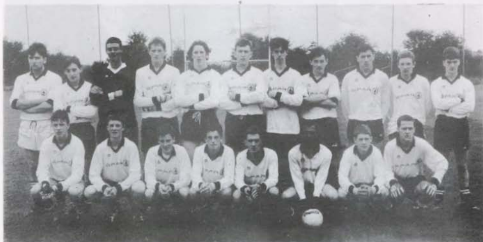
J. K. BRACKENS MINOR FOOTBALL