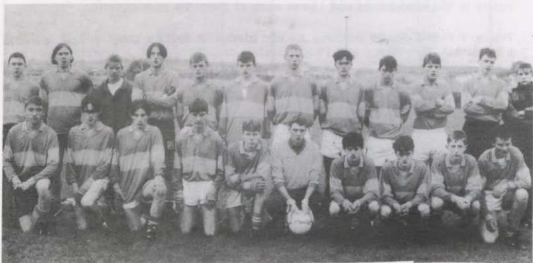
AHERLOW MINOR FOOTBALL TEAM