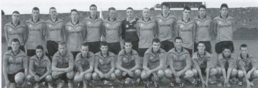
Moyle Rovers Minor Team