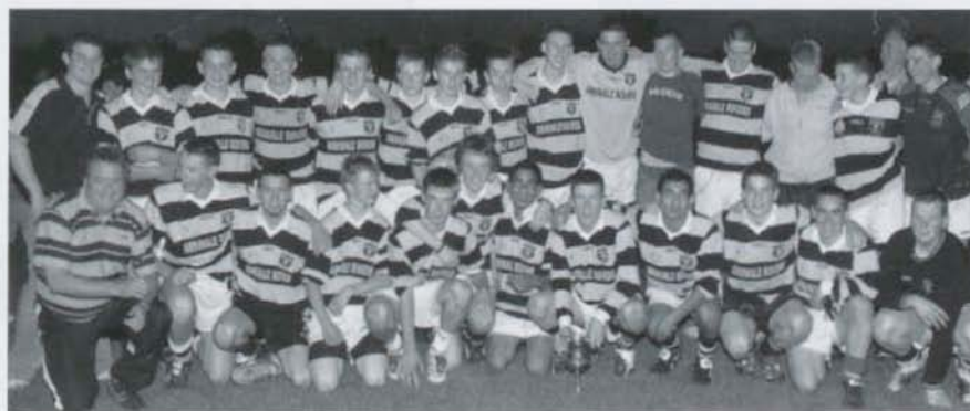
Arravale Rovers MFC 'A'