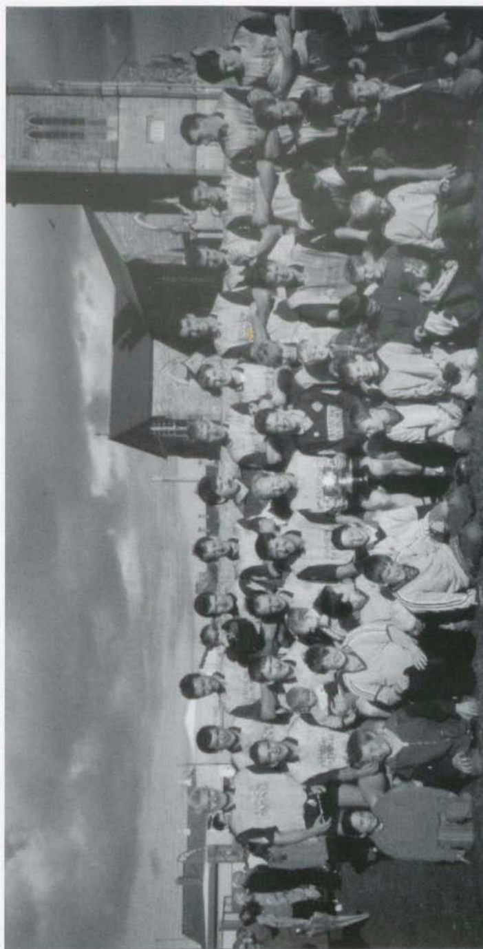
SENIOR COUNTY CHAMPIONS 1995