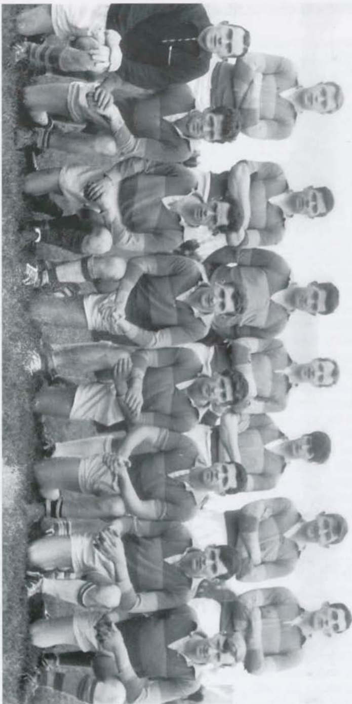
Commercial's Team 1966