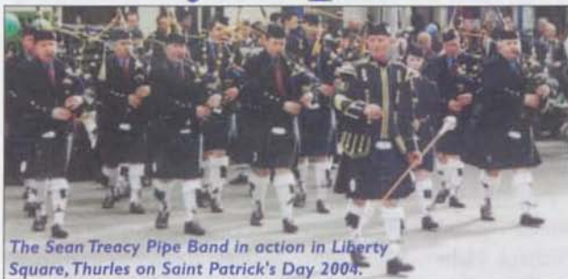
The Sean Treacy Pipe Band in action in Liberty Square, Thurles on Saint Patrick's Day 2004.

The Sean Treacy Pipe Band is synonymous with the GAA and big match days in Semple Stadium. Mid and County finals as well as inter-county games would not be the same if the Sean Treacy Pipe Band did not lead the participating teams around the field before the match. During its 70 years in existence, the Band has played in venues all over Ireland, in competitions, at parades, religious events, sports meetings and of course GAA matches. The band has also travelled overseas to the UK and USA to name but two locations. The band was formed in 1934 by some members of the former fife and drum band that was in the parish of Moycarkey-Borris, making this year the 70th