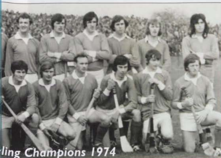
ling Champions 1974

We salute them - the men of '74 and hope they enjoy their day in the limelight.