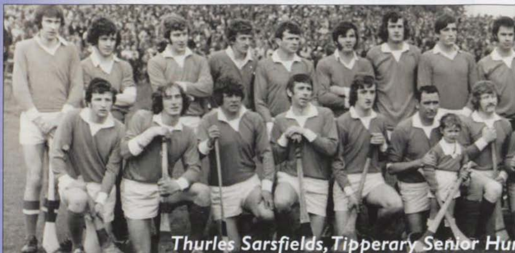
Thurles Sarsfields, Tipperary Senior Hurling