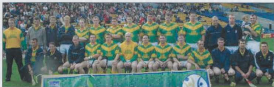
Toomevara Senior Hurling panel in County Semi-final against Mullinahone.