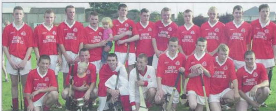
Carrick Davins Minor Hurling team

Carrick Davins team that won the South Minor Hurling Championship 'B' Final sponsored by M K Sports.