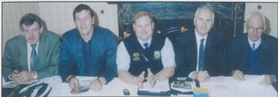
Tipperary Youth Committee