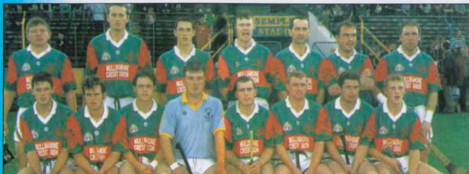
CJ Kickhams, Mullinahone, Co Senior Hurling Finals 1997