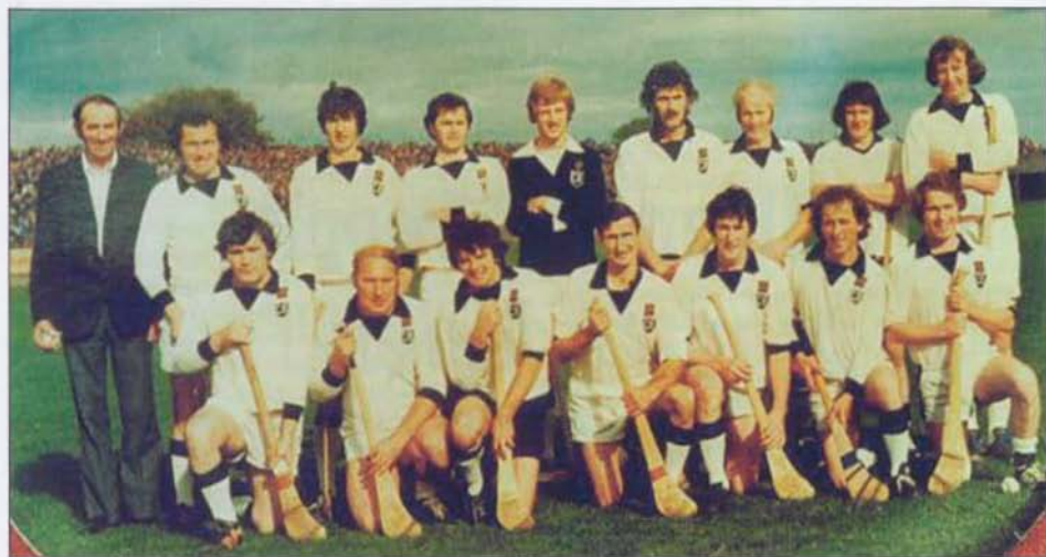
Kilruane MacDonaghs 1977-1979 team