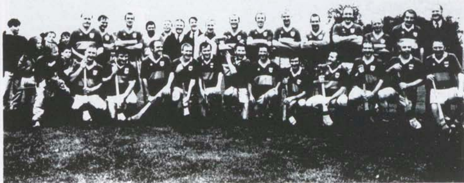
The Tipperary Over-40's hurling team who beat Dublin in the Masters final.