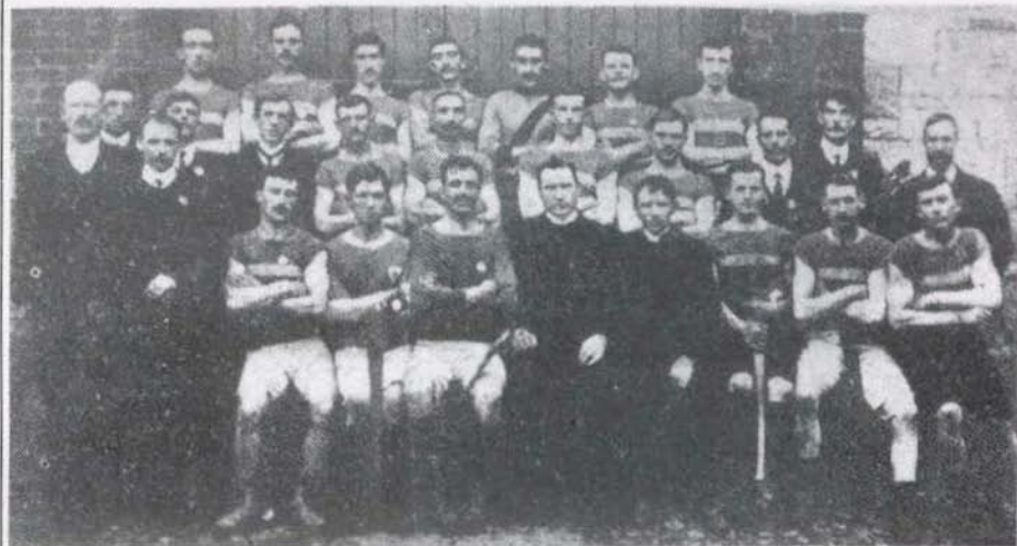
The Blues team who won Tipperary's eighth All-Ireland Senior Hurling title, together with officials of the club.