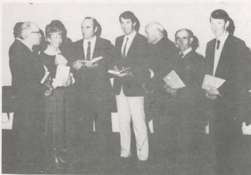
The Launching of Cashel G.A.A. History Book